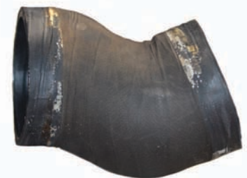
TR Hose vs. Stock Hose